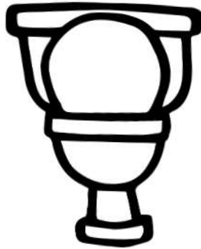
go to the bathroom